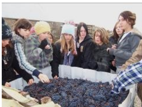
Left: Sampling grapes at the BlackRidge Vineyard

As part of the practical aspects of the year 11 Geography curriculum, the geography students with their teachers visited the Taieri Plains, Ophir, Bannockburn and Macraes Flat. The students researched geographical information for achievement standards related to Dairying and goldmining.