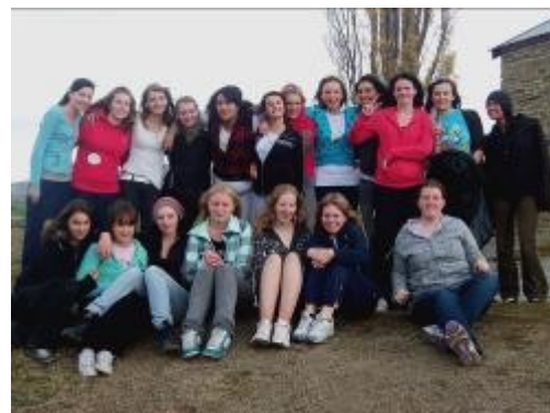
Right: The group taking a break